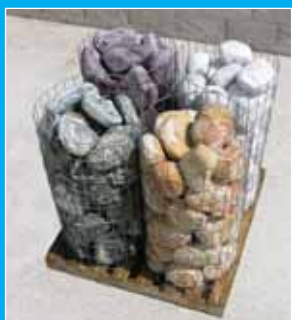
Multi-Basket Products (MR) Rounded & (MA) Angular