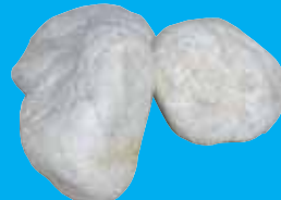
Absolute White (MR)