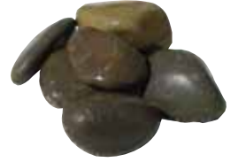
100-200 Scottish Beach Cobbles