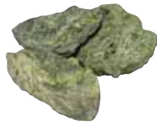
Green Spaghetti (MA)