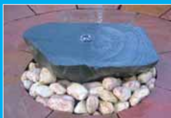
Sawn Boulder Water Feature