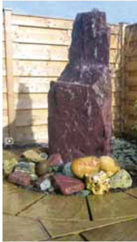
Slate Monoliths (Drilled or Undrilled)