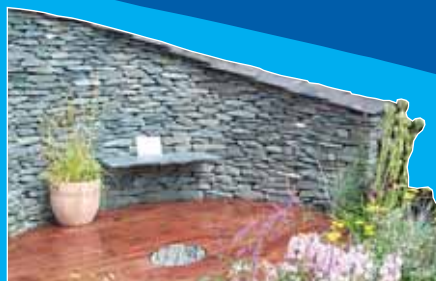
Slate Walling Stone