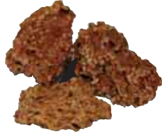
Red Spaghetti (MA)