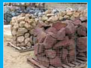
Baskets of Crated Rockery Stone